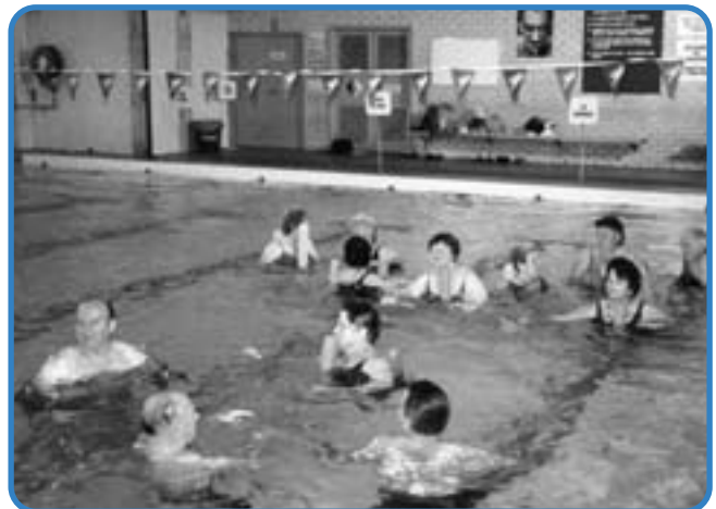
Members of the Croatian community participating in gentle exercise and aquarobics.