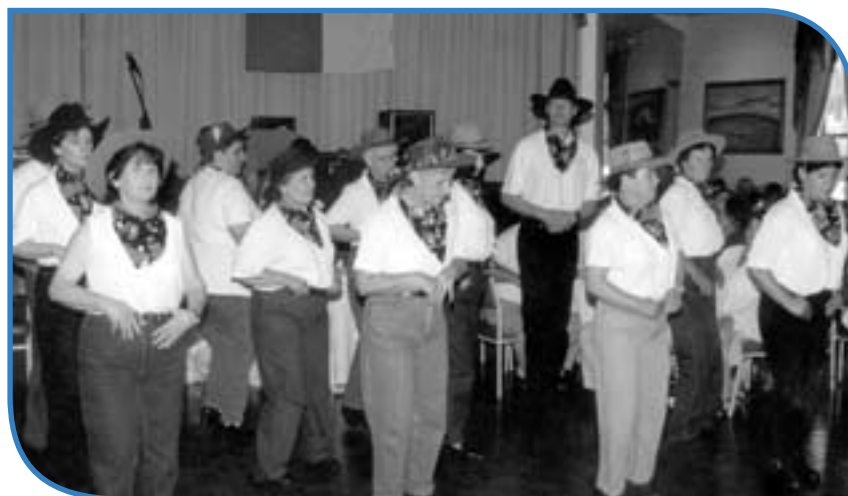
The Maltese Line Dancing group demonstrating their new skills